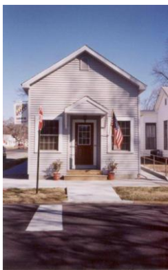
1139 Sycamore St.

We have agencies that take much care helping to preserve and promote the area and the buildings. But, downtown at 11 th & Sycamore St. is a building housing an agency that spends much of its time caring for many of the people in that area --- the Lincoln Central Neighborhood Family Center.