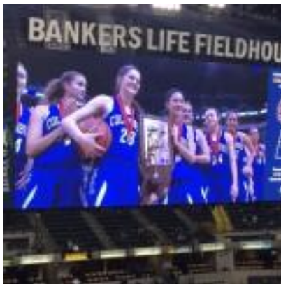
(Bull Dogs on the podium with their state runner-up trophy)