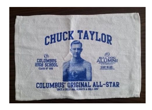
150th Day of School of 150th Year