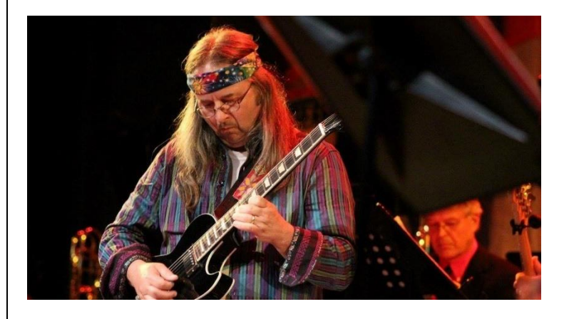
IT'S ALWAYS A GREAT EVENING!!

Ticket sales are historically brisk and will probably begin around the preceding Monday. Watch our website and Facebook page for actual dates. This will be a great show!!