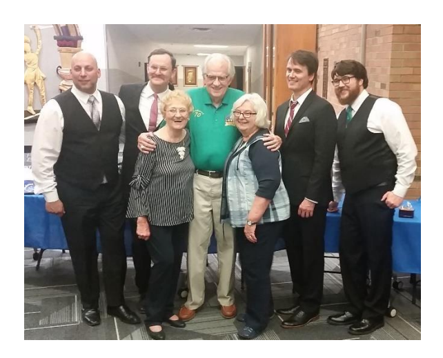
Veterans Memorial Dedication