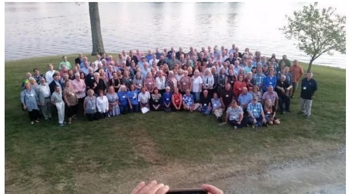
(Class of 69 classmates at Harrison Lakes)

And, the class of 1969 may have set a new standard for 50-year reunions. We say that, not just because of the energy we saw during their weekend celebration, but because of the AWESOME job they did of locating such a high percentage of their classmates.