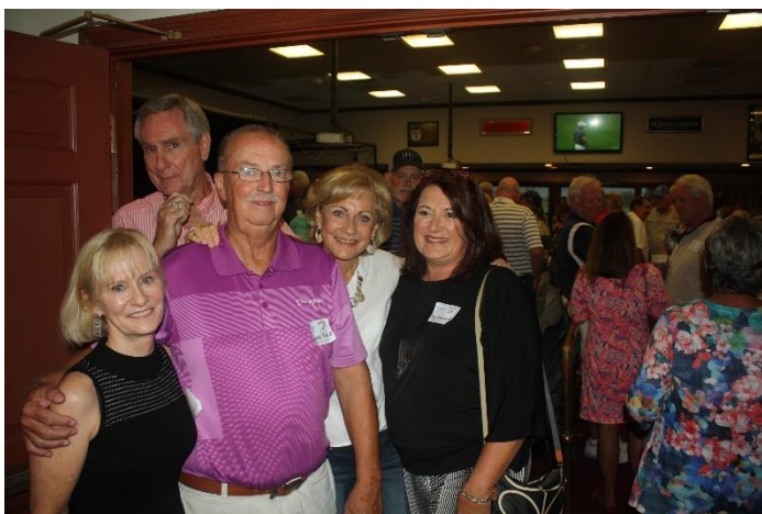
Reunion Smiles are Good for the Heart!!

https://www.columbusnorthalumni.org/reunion-resource-page/reunion-assistance-alumni-association/